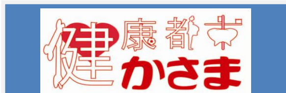
Logo of "Healthy City Kasama" was created by local high school students

Kasama City is located in the central part of Ibaraki Prefecture. City is blessed with rich culture and natural resources, such as Kasama Porcelain, Inada granite, and various crops. Amount of chestnut cultivation area is the largest in the prefecture. Also, small chrysanthemum and plum are widely cultivated. Nowadays, utilizing geographical advantage of traffic infrastructures, city has been developing industries characterized with these resources. Also, blessed with tour resources of historical heritages and art and traditional culture such as Kasama Inari shrine, Kasama Porcelain, where pottery and potter participate, many tourist visit the city especially in the national holidays. Furthermore, nature shows different seasonal colors represented by blooming cherry and azalea, chrysanthemum, etc.