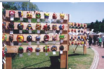
Porcelain Fire Festival